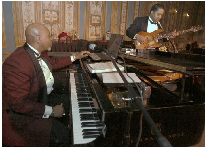
The Woody Woods Quartet entertained the guests with a variety of Jazz music and featured two female vocalists. Piano donated by Southern Nevada Music.