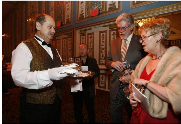
Ice sculptures, and crystal chandeliers created an atmosphere of understated elegance for the guests.